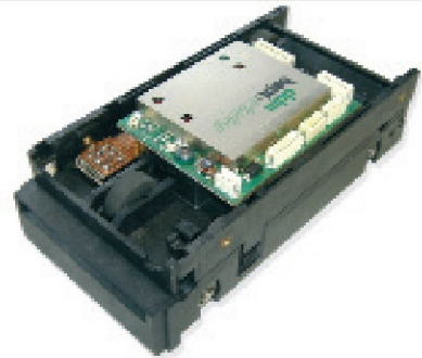
Hybrid card reader combined with a contactless reader